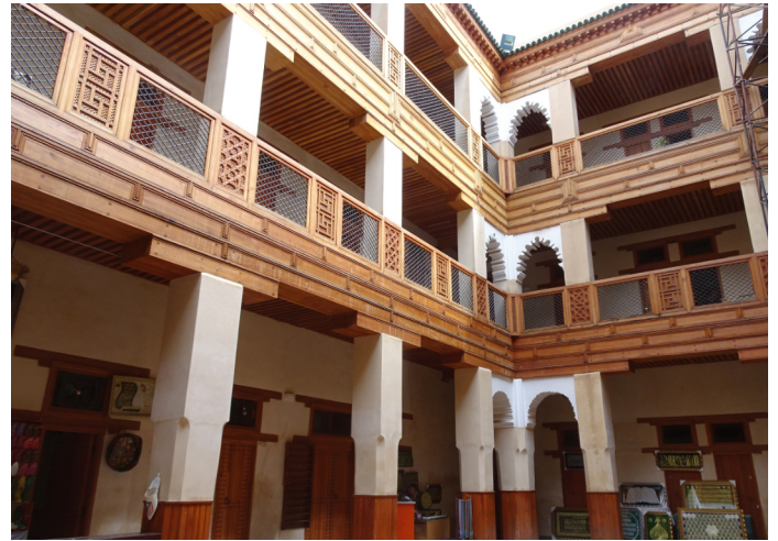
A restored caravanserai in Morocco - Janet Dickson