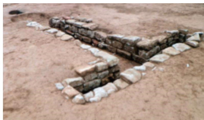
North Somerset Council granted Sunley Homes Ltd planning permission for the site to be developed. Prior to work starting, the developers engaged a professional archaeologists firm (AC Archaeologists) to repeat the survey and dig the site.